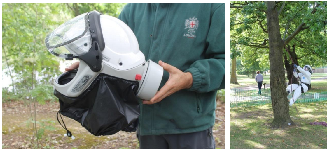
Figures 13 & 14. Images of specialist PPE