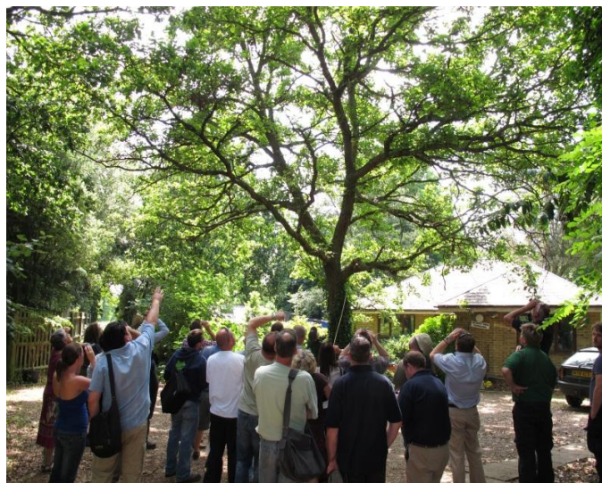
Figures 8 & 9. Author's own images of training