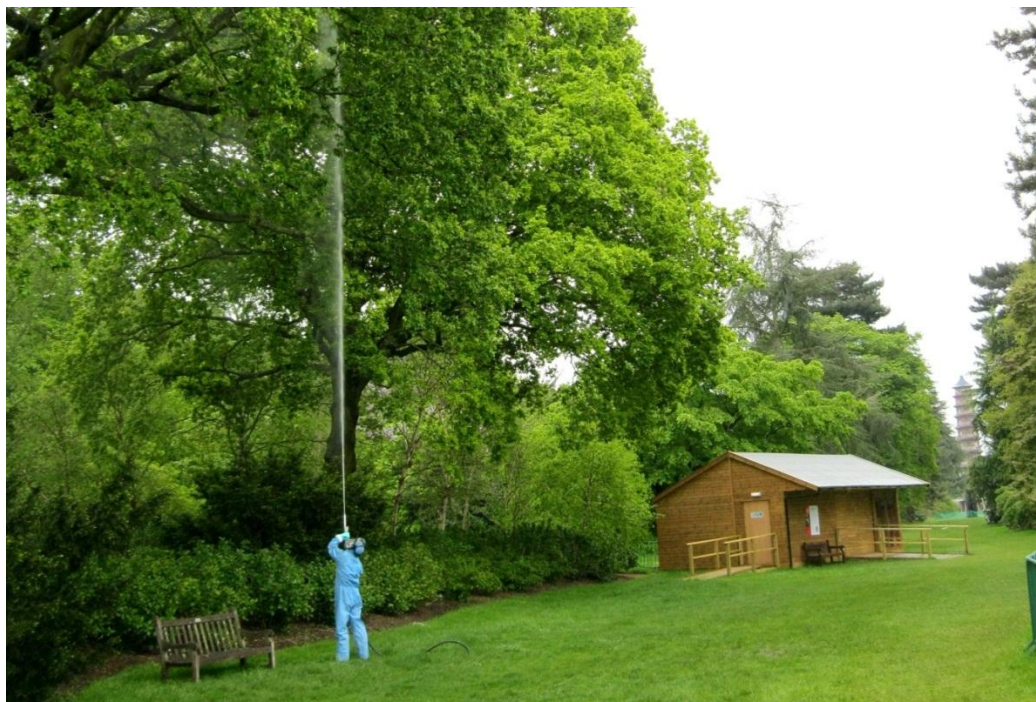
Figure 17. OPM spraying at Kew gardens

24. The Tree Team will continue inspections of areas deemed to be at risk, based on the previous year's inspection areas, the nest location map, the jogger's route map, FC inspectors' discoveries, plus public and staff reports. The Team will continue with the removal of discovered nests, and with staff presentations in the field showing nests, caterpillars and browsing.