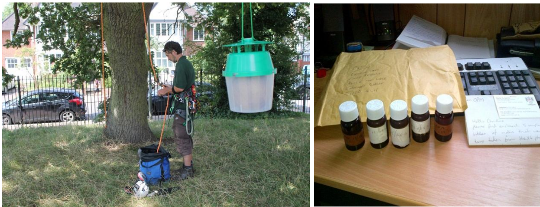
Figures 10 & 11. Author's own images of pheromone trapping