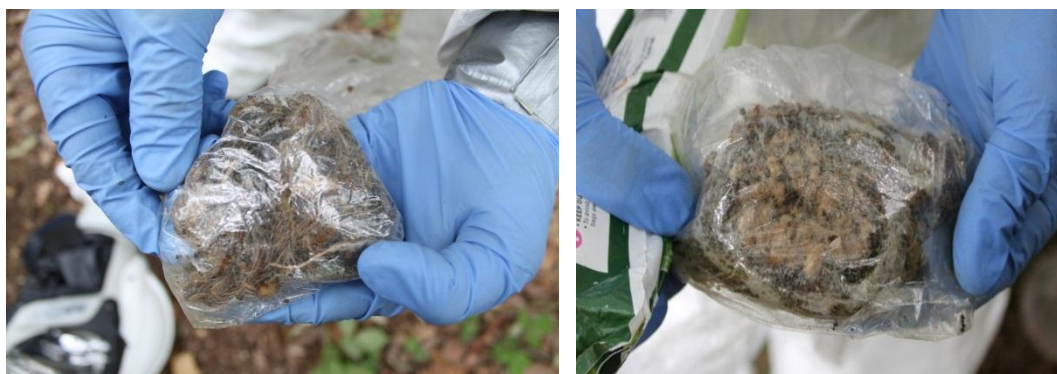
Figures 15 & 16. Author's own images of removed nests