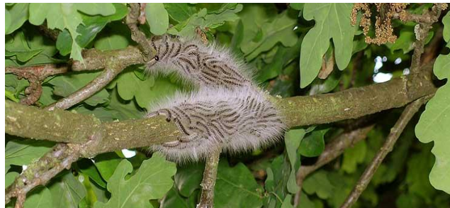
Figures 1 & 2. Forestry commission images of moth and caterpillars